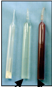
Start (pale blue) End (blue)